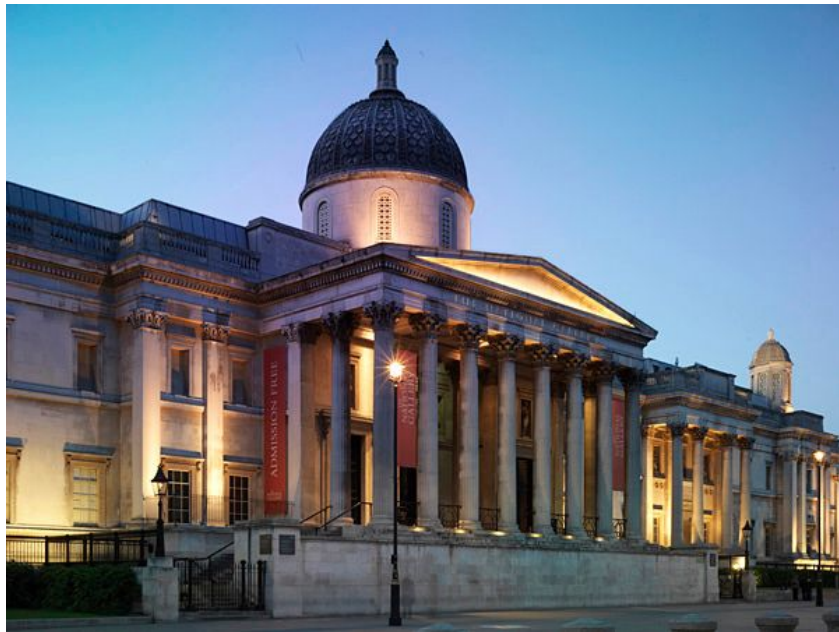
The British Museum - London, England