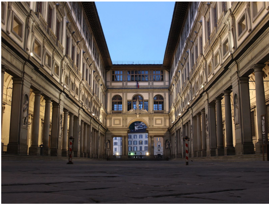
The Guggenheim Museum Bilbao - Basque Country, Spain