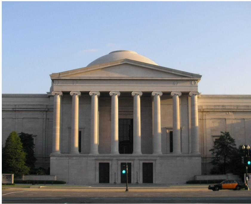
The State Hermitage Museum - Saint Petersburg, Russia